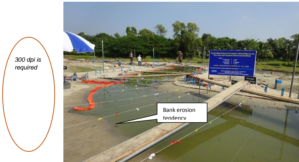
Fig. 3. Bank erosion tendency at the upstream of the proposed revetment for test T1

Note: Dot per inch. Dpi (actually, pixel per inch. ppi) is important in case of printing.